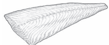
Alaska Halibut Fletch